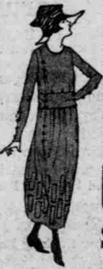
This Betty Wales Model $20.00

YOU HAVE OFTEN SEEN DRESSES that you completely—and yet when you came to describe them you simply could not tell just what it was that won your admiration. It was the charm of simplicity. That charm characterizes BETTY WALES DRESSES throughout, and distinguishes them from all others. It is the simplicity that demands the utmost skill in cut and design—a simplicity that subordinates the trimming scheme—in short the simplicity of good taste. Betty Wales dresses are shown in a multitude of smart models for girls and young women and for women who want to remain young. Made up in serge and satin combinations, also wool jersey. Two popular models are here pictured. — These dresses range in price from $20.00 to $38.50.