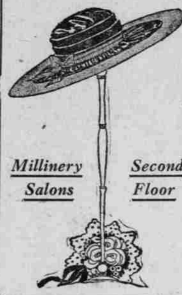
Millinery Salons Second Floor