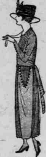
This Betty Wales Model $26.50

Special Showing of New Suits and Coats for Juniors—2d Floor