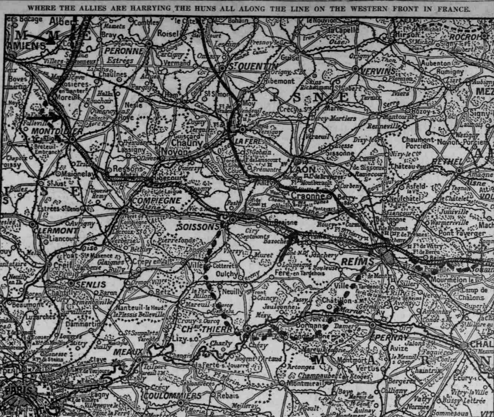
Heavy Shaded Line Represents the Present Battle Front. Dotted Lines Represent the Extent of the German Advance Before the Allies Launched Their Great Counter-offensive. Heavy Black Line Extending Eastward from St. Quentin Past Rheims is the Battle Front Prior to the Great German Offensive Which Was Launched March 21. Arrows Show Where the Allies Are Delivering Their Heaviest Blows Now—First, Near Albert, Where Important Positions on the Ancre River Have Been Taken and a Retreat Forced; Second, in the Montdidier Sector, Where the Allies Have Pushed Through to the Avre, and Third, on the Vesle Front, Where the Heavy Guns Are Rippling Up the Territory Between the Vesle and Aisne Rivers, Through Which the Germans Are Retreating.