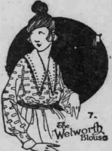
—Meier & Frank's: Blouse Shop, Fourth Floor.

just received and just unpacked, go on display and sale for the first time today. These new arrivals evidence all the latest style tendencies, besides being made of splendidly serviceable materials. The fit, workmanship and finish of Welworth blouses are unsurpassed by any blouse at or anywhere near this low price—$2. Sold here only in Portland.