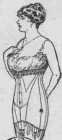
—Meier & Frank's: Corset Shop, Third Floor.

Our expert corsetiers will see that you secure the right Nemo model for your particular type of figure. Nemo corsets range in price from $4.25 upwards.