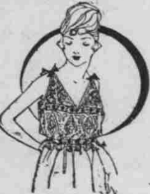
—Meier & Frank's: Main Floor, Fifth Street.

Lacette—a semi-made corset cover lace in Val and Filet designs combined. 1 1/4 yards of this splendid lace makes a camisole like the one illustrated at left. Moderately priced at $1.25 a yard.