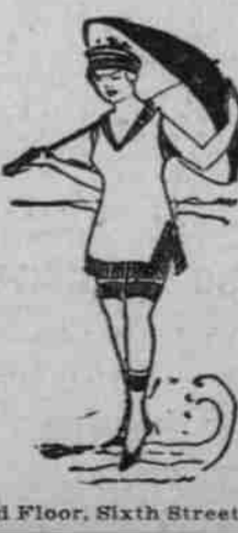
—Meier & Frank's: Third Floor, Sixth Street.

Cotton bathing suits priced at $2.50, $3, $4.50 and $5.45.