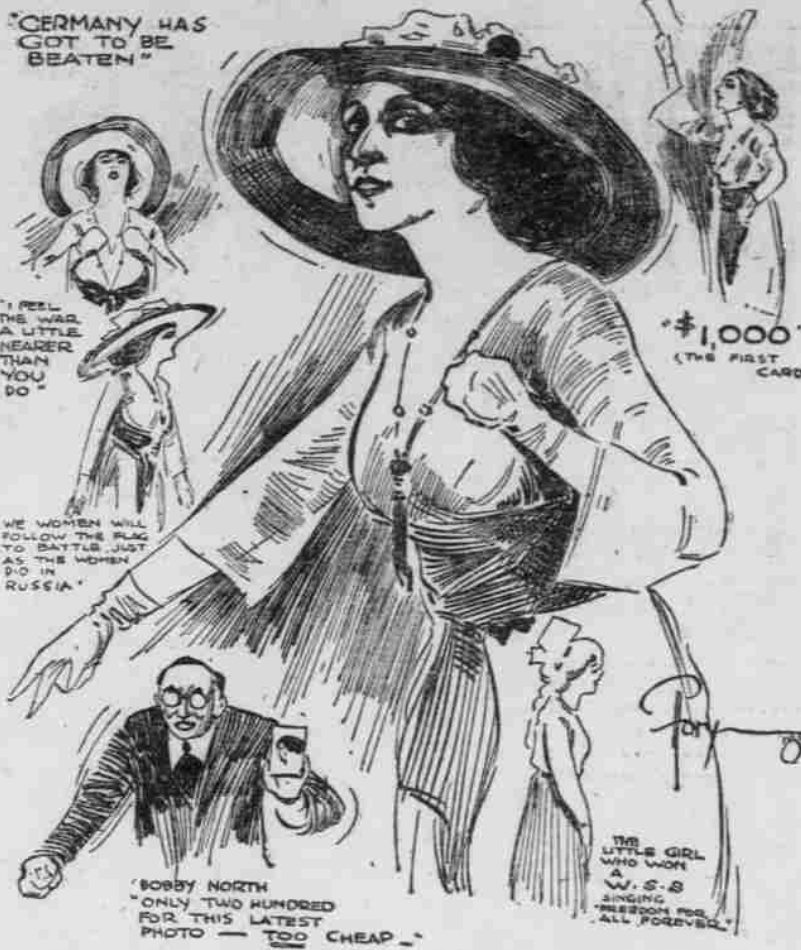
'GERMANY HAS GOT TO BE BEATEN'... 'THE GIRL WHO WON'... 'BOBBY NORTH'...