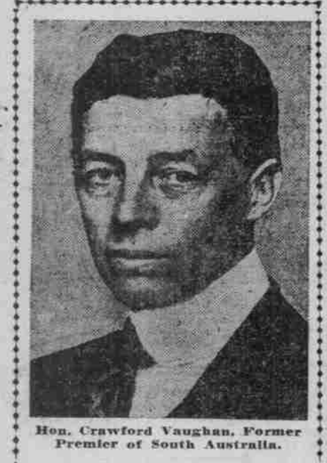
Hon. Crawford Vaughan, Former Premier of South Australia.

Hon. Crawford Vaughan, former Premier of South Australia, was the principal speaker at the members' council of the Chamber of Commerce at the weekly luncheon yesterday. Mr. Vaughan has been occupied for the past seven months on behalf of his government in the interest of developing trade relations of mutual benefit to the allied cause and in visiting the shipbuilding plants engaged in the production of tonnage for the United States and other countries. During the past week Mr. Vaughan spent some time in the Puget Sound district, where two yards are engaged in building ships for the Australian government.