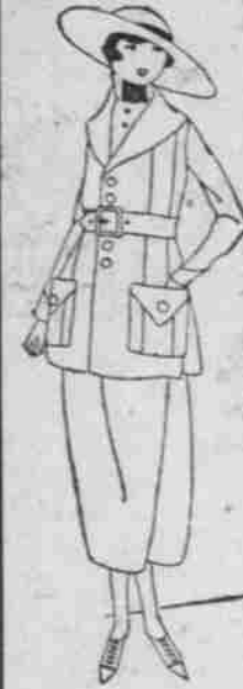
Apparel Shop, Fourth Floor.

New linen suits in all desirable shades $15 to $25.