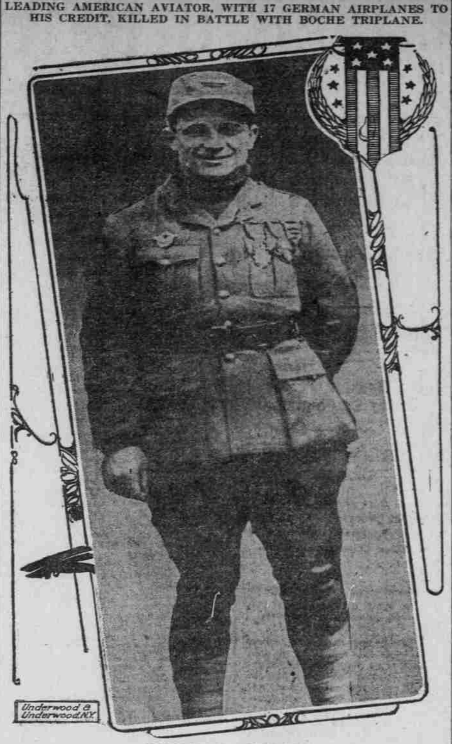
MAJOR RAOUL LUFBERY.