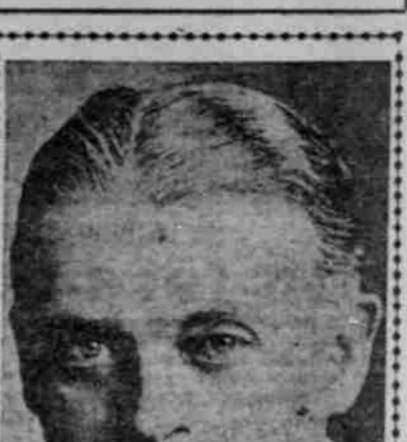
Cyril Maude, Noted English Actor, Who Appears at Hellig Theater Tonight.