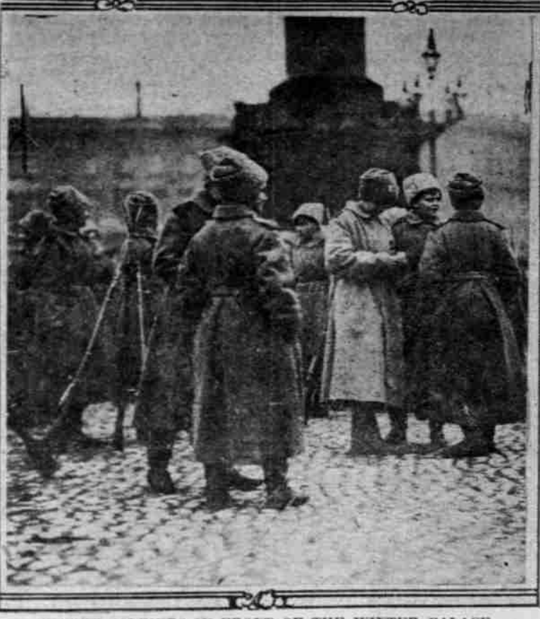
WOMEN SOLDIERS IN FRONT OF THE WINTER PALACE.

When we walked straight along the corridor when we came out of Kerensky's office to the front of the palace. Here were hundreds of junkers, all armed and ready. Straw beds were on the floor and a few were sleeping, huddled up in their blankets. They were all young and friendly; they had no objection, they said, to our being in the battle; in fact, the idea rather amused them.