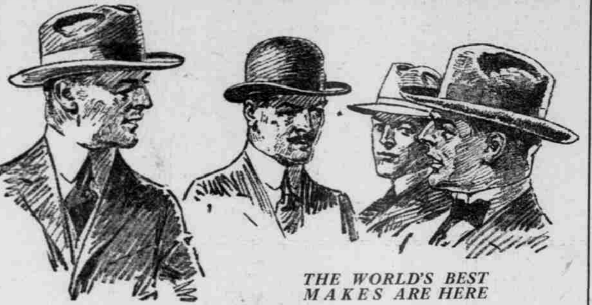
THE WORLD'S BEST MAKES ARE HERE