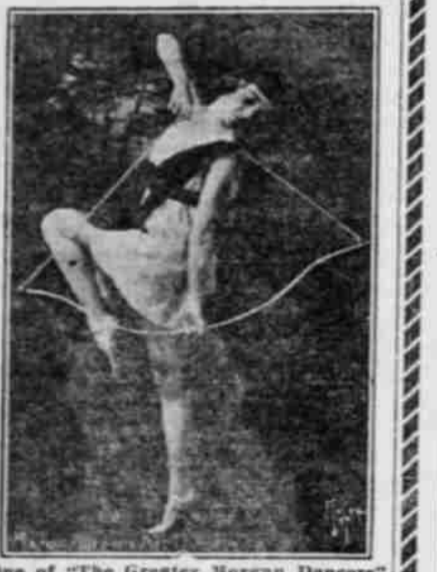
One of "The Greater Morgan Dancers" at Orpheum.