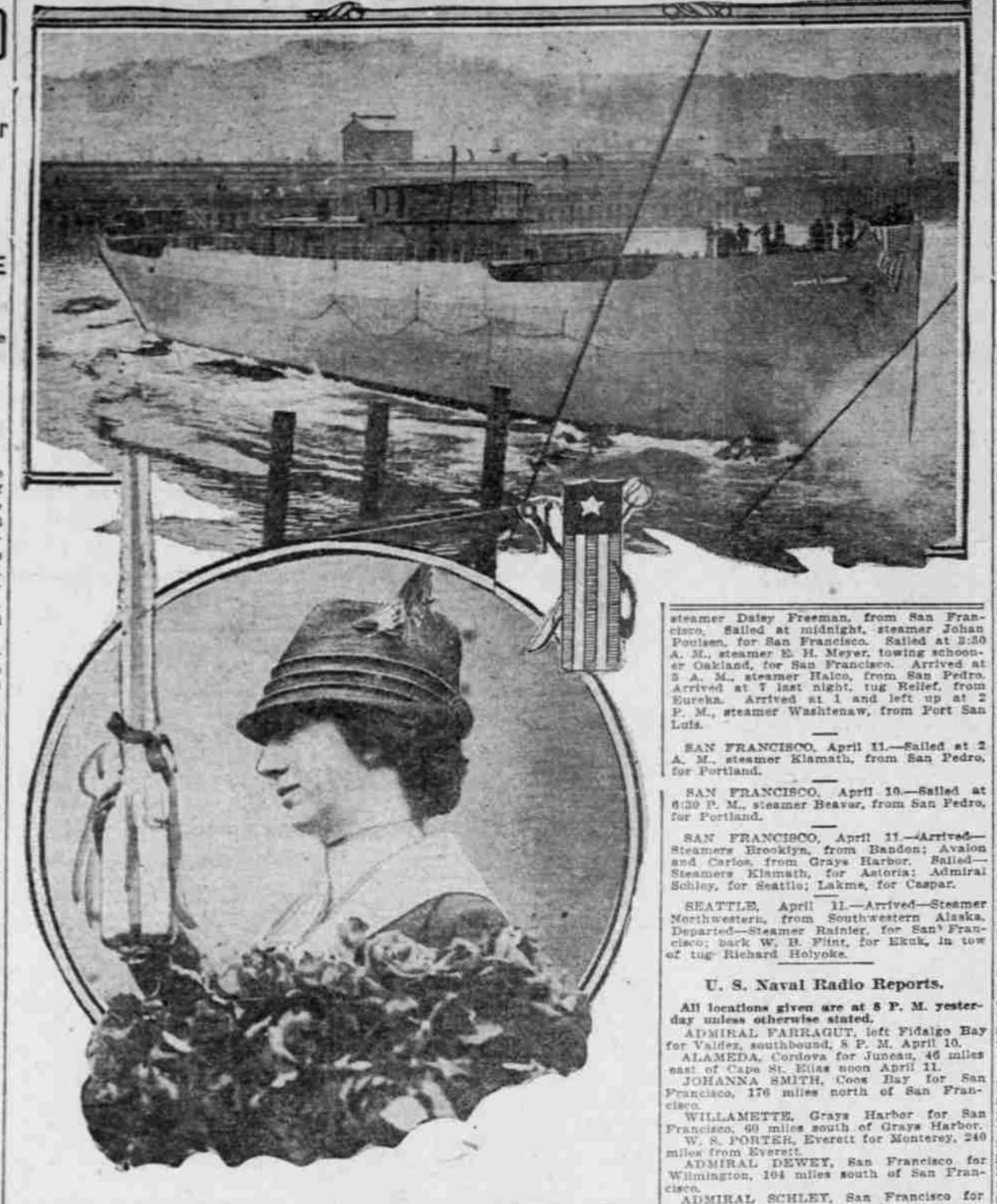
Upper-Hull of Point Lobos Sliding I nto Willamette. Lower-Mrs. Emer.

FOURTH STEEL CARRIER AT ALBINA ENGINE & MACHINE WORKS FIGURES IN ONE OF MOST BUSINESSLIKE LAUNCHINGS YET CONDUCTED.