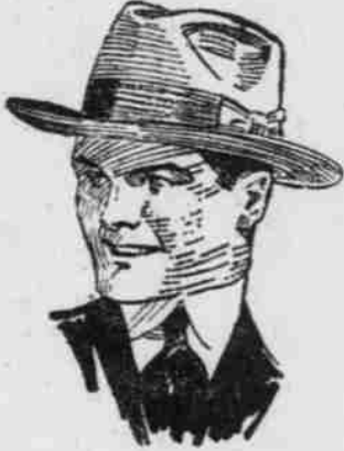
-Main Floor, Fifth Street.

Stetson soft and stiff hats $5-$6. Knox soft and stiff hats $5-$6. Mallory Cravenette proof hats $4. Borsalino imported Italian hats $6.