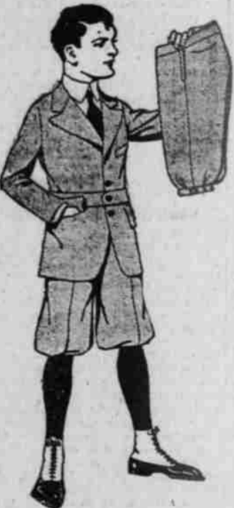
Boys' Clothing Shop, Third Floor.

The two-pants suits for boys that we are going to sell today at $10 are made from finest selected fabrics, in the newest and most popular patterns and colors. Included in the lot are about 100