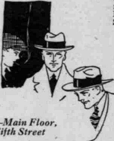
Main Floor, Fifth Street

Men—your new Spring hat is waiting for you at Meier & Frank's. Today we particularly feature the M. & F. special hats at $2 and $3. The new wide military shapes so much in demand. Made with wide or narrow bands. Fashionable shades of green, gray, brown, tan and black.