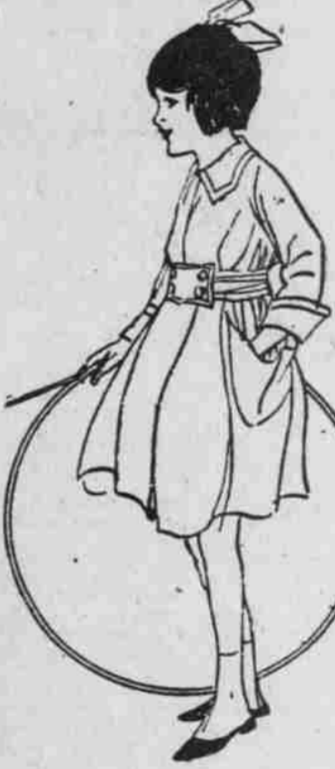
Children's Shop, Second Floor.

Misses' fine heavy wool sweaters in brush, fancy and machine stitch. Many have large sailor collars and belts. Plain colors and with contrasting color trimmings. Sizes from 8 to 14 years. Very moderately priced from $5.95 up to $12.