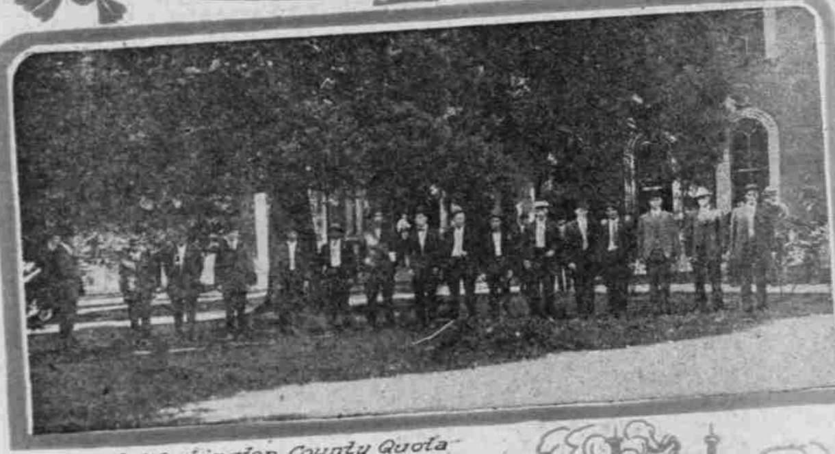
Roll Call of a Washington County Quota Before Leaving for American Lake.