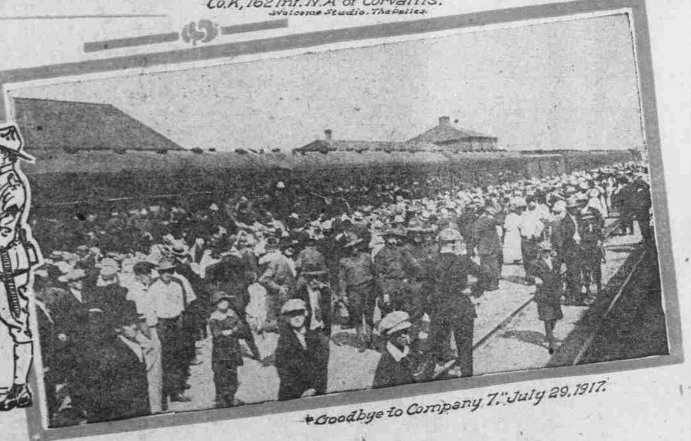
Goodbye to Company T, July 29, 1917.