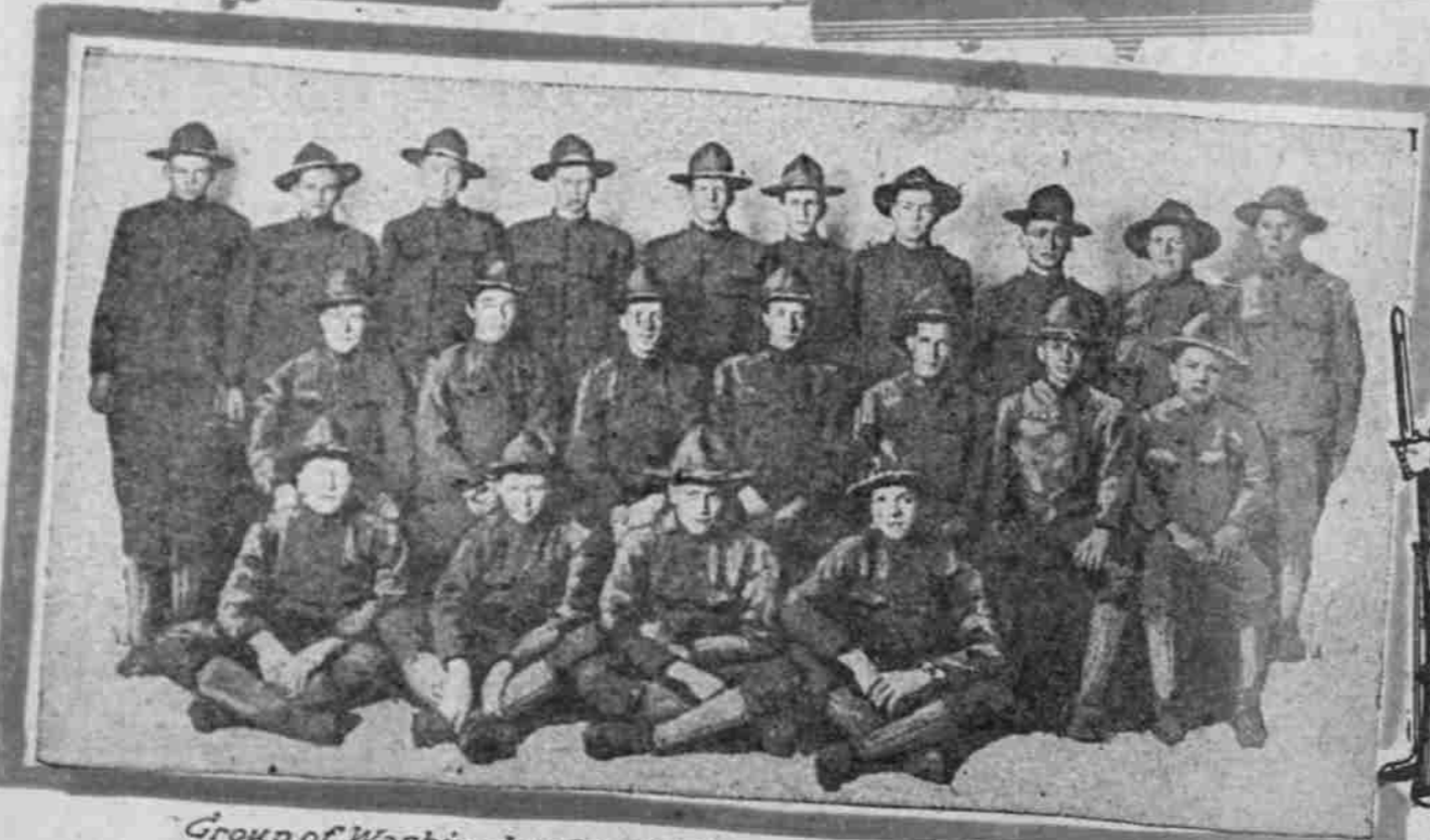
Group of Washington County Boys Who Responded to First Call for Volunteers.