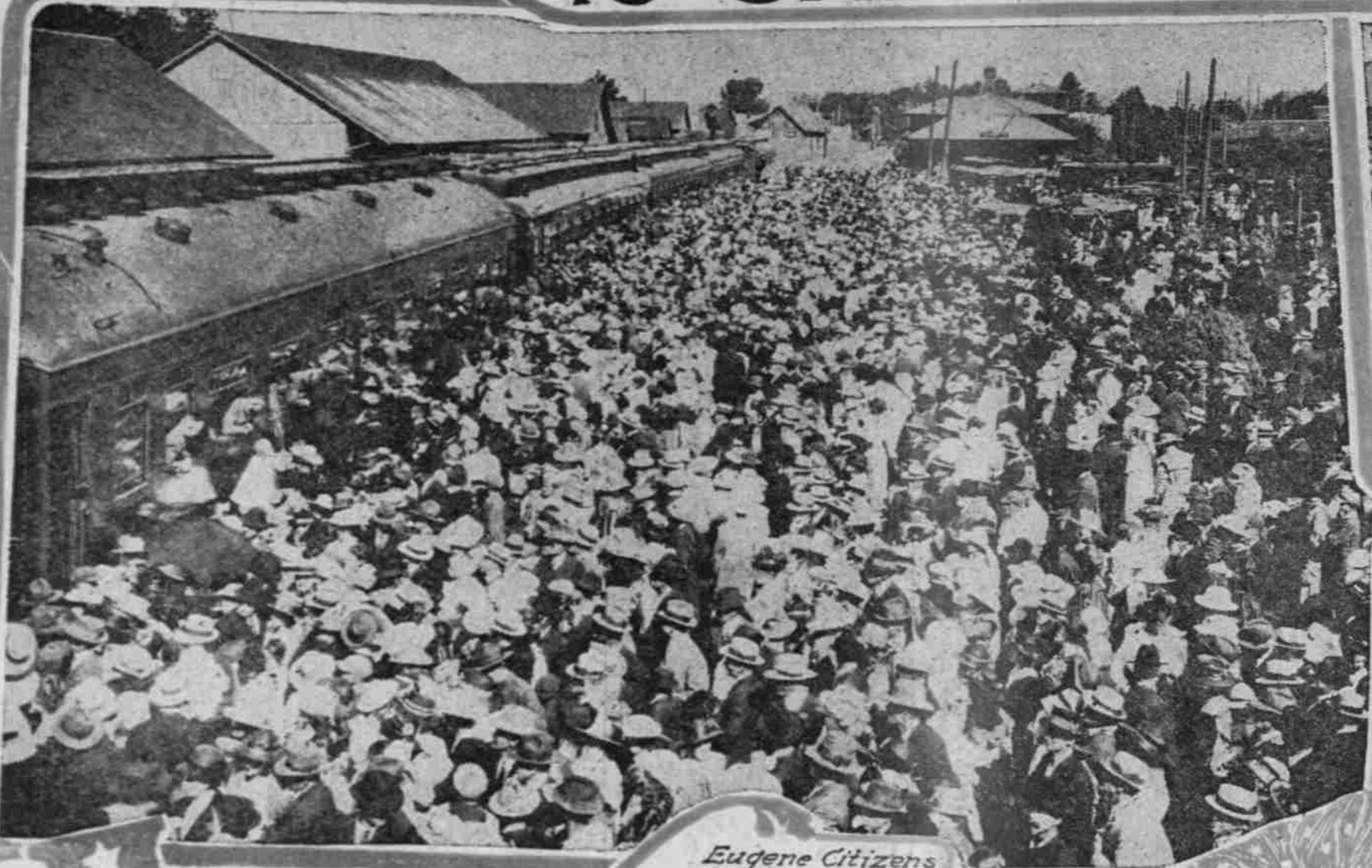
Eugene Citizens Saying Goodbye to Troops.