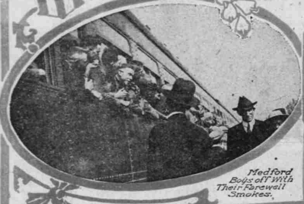
Medford Boys off With Their Farewell Smokes.