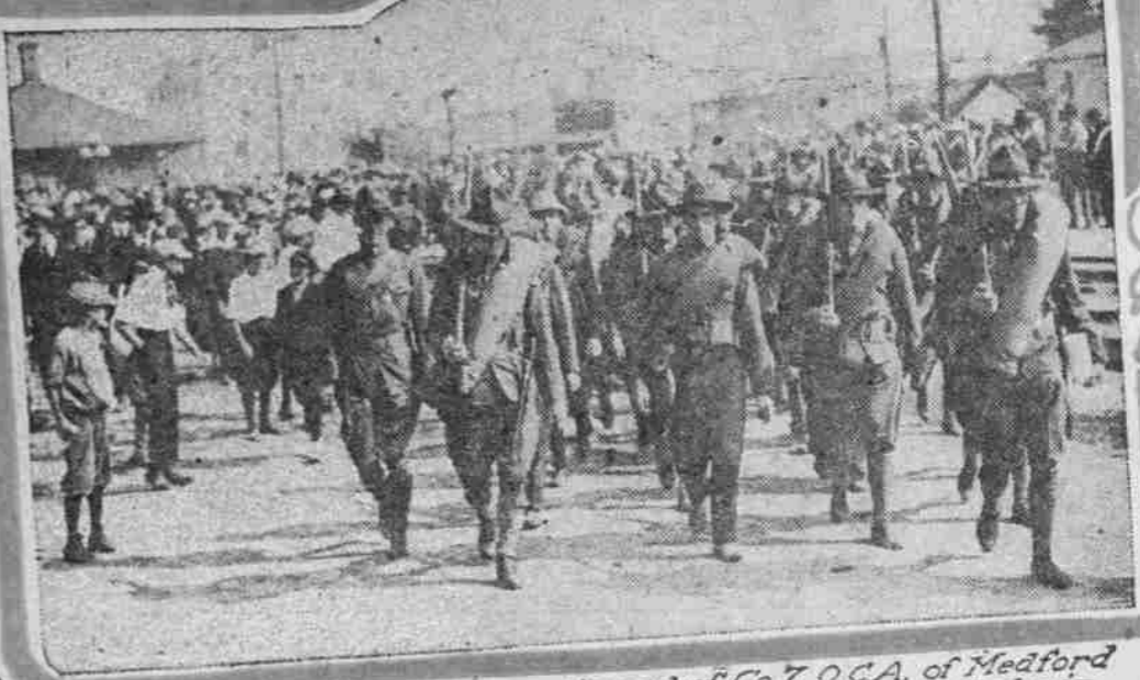
Squad of Co. T, O.C.A. of Medford About to Entrain.