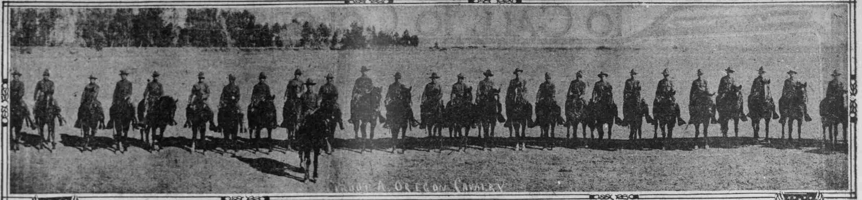
Troop A, Oregon Cavalry on Duty at Mexican Border, 1916-1917.

Every Department of the National Army Has Big Representation of Valorous Men From Beaver State