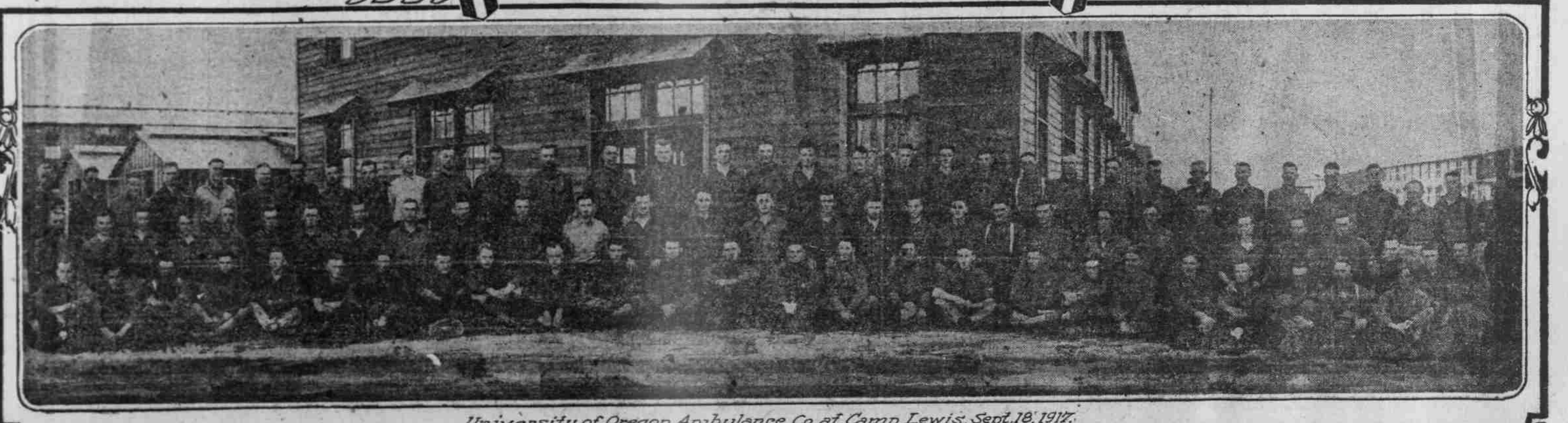
University of Oregon Ambulance Co. at Camp Lewis, Sept. 18, 1917.