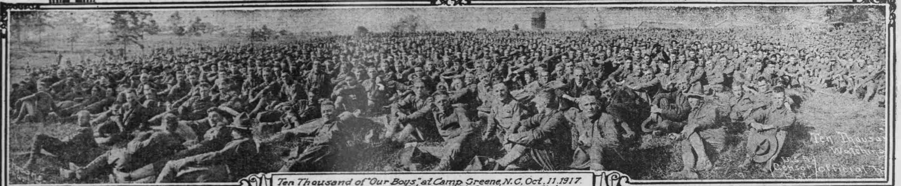
Ten Thousand of "Our Boys" at Camp Greene, N.C., Oct. 11, 1917. Released, U.S.A. Conson. - Neuse Photo.