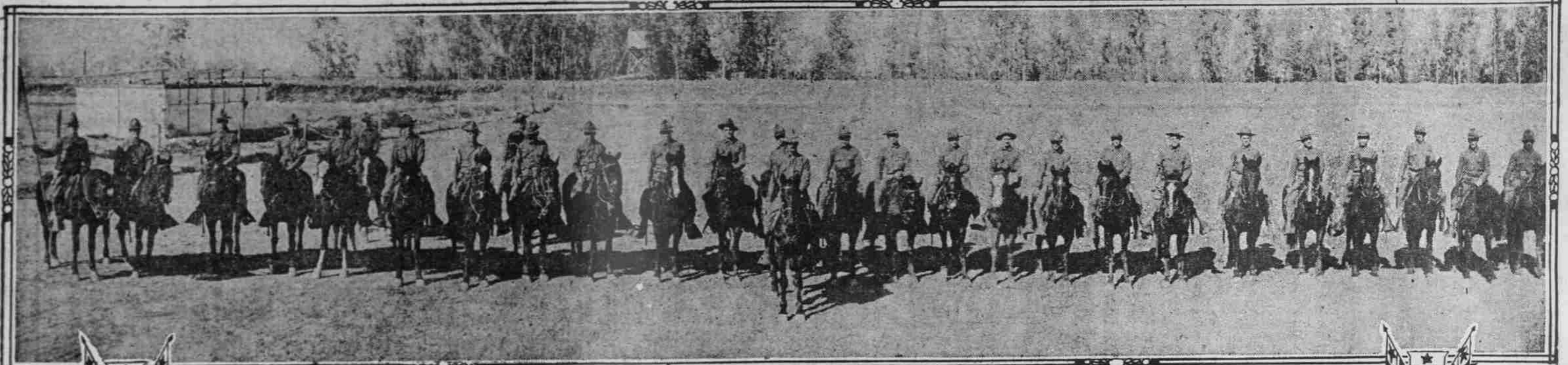
Troop A, Oregon Cavalry, on Duty at Mexican Border, 1916-1917.

Large Number of Men in National Army Are Seasoned Veterans—All Eager to Protect Nation's Honor