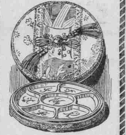
Sweetmeat Boxes, in various sizes and combinations of coverings. The one illustrated is covered with Chinese brocade silk in attractive colors and is priced at $7.75.