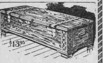
Cedar Chest, as illustrated, top measures 18x44 inches. 16 inches high. Special $13.95.

Both Oriental and American-made furniture gift articles will be found on display in our Furniture Gift Shop. We select from hundreds of items today: Yarn Holders, direct from the New York shops of Mark Cross & Co. Various colors of silk used with bases enameled to match. Special $8.50.