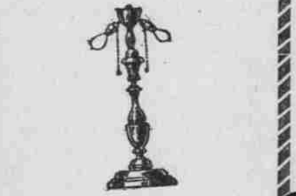
Mahogany Table Lamp, two lights. Special at only $5.45.