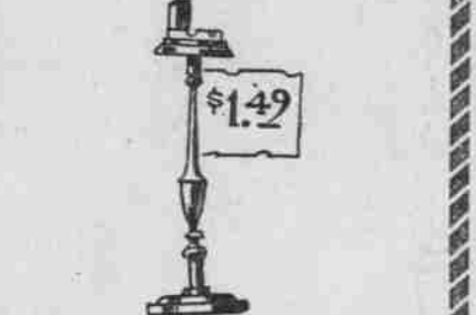
Mahogany Smoking Stands, with glass ash receiver. Special $1.49.