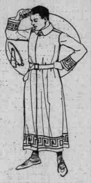
—Men's Clothing Shop, Third Floor.

One Illustrated Sizes to fit all men in these fine robes. The price is very moderate—$7.50.