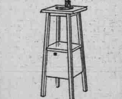
Smoking Stand, wax or fumed oak, $2.95.