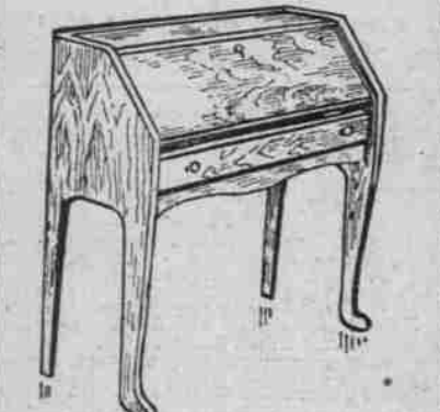
Desk, quarter-sawed oak, wax finish, $13.75.