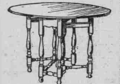
Solid Mahogany Gate Leg Table, top 34x40 inches, $18.85. Tapestry Covered Stool, fumed oak or imitation mahogany, at $2.95.