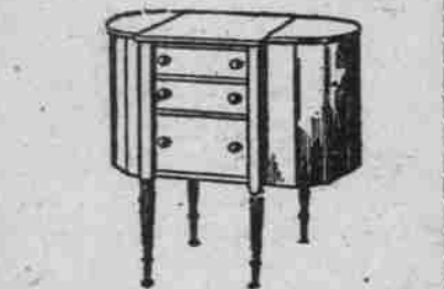
Martha Washington Sewing Table, part mahogany, $10.65. Cedar Chest, top measures 18x44 inches, $13.95.