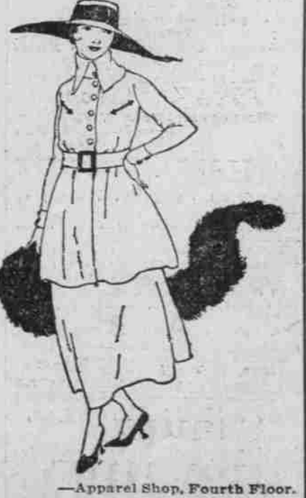
—Apparel Shop, Fourth Floor.