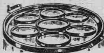
Mahogany Tray with 7 coasters in glass holder, as pictured, $2.45.