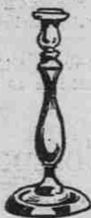
Mahogany Candle Sticks, several patterns to select from, 95c.

On the Ninth Floor, Sixth Street, we have assembled several hundred pieces of desirable gift furniture. Both American-made and Oriental gift furniture will be found on display. We single out the following few articles for especial mention today; remember, there are hundreds of equally attractive pieces to select from at correspondingly low prices. Purchases held for later delivery if desired.