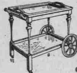
Tea Wagon, William and Mary design, with removable glass tray, $14.50.