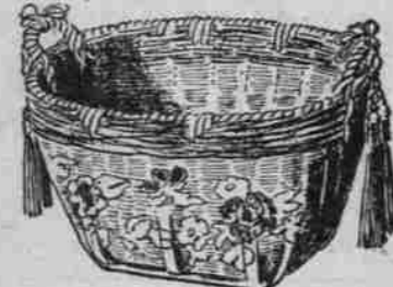
Chinese Baskets, decorated, many different shapes and every color combination, priced as low as $5.50.