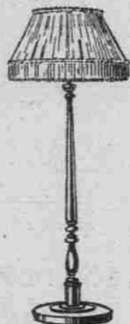
Mahogany Lamp and Shade, as illustrated, $14.90.