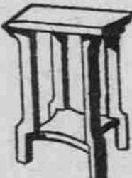
Oak Tabouret, wax or fumed finish, three patterns, one illustrated, $1.65.