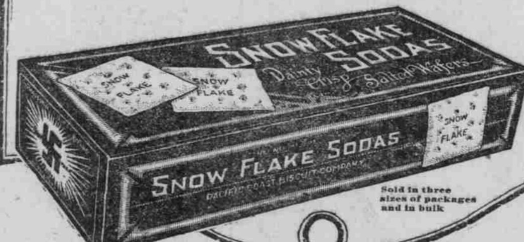
Sold in three sizes of packages and in bulk

Pacific Coast Biscuit Co. Portland, Oregon