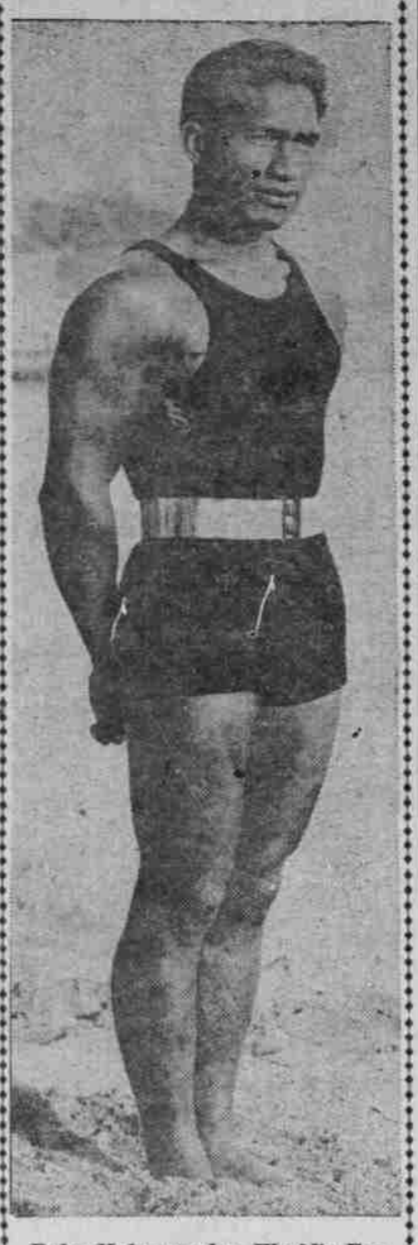
Duke Kahanamoku, World's Famous Swimmer.

Honolulu Aquatic Marvel Has Been at Home in Water Since He Was Four Years Old—Recent Feats Reviewed.