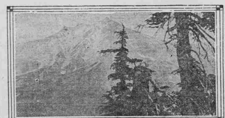
View of Mt. Jefferson From Pamelia Lake Heights.

Pasho Tvanokeff Packing Camera up Mt. Wefferson