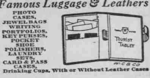
PHOTO CASES, JEWEL BAGS WRITING PORTFOLIOS, KEY PURSES, POCKET SHOE POLISHERS, LAUNDRY SETS.

PULLMAN SLIPPERS, OVERNIGHT BAGS (Fitted With Tollet Articles), EMERGENCY CASES AND MEDICINE CASES (for Outing