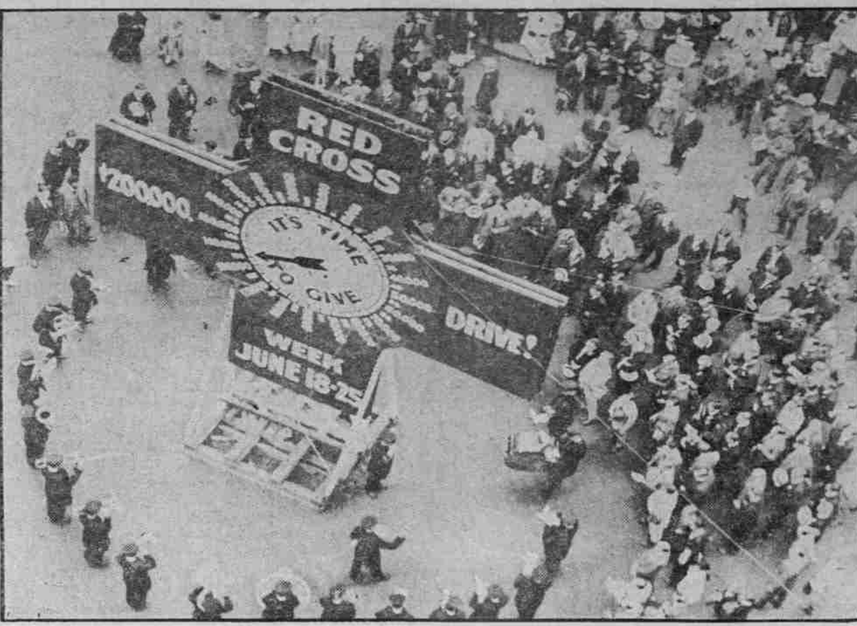
UNIQUE PHOTO FROM THE OREGONIAN OFFICES SHOWS BAND PLAYING "STAR-SPANGLED BANNER," WHILE CROWD STANDS WITH HATS OFF.