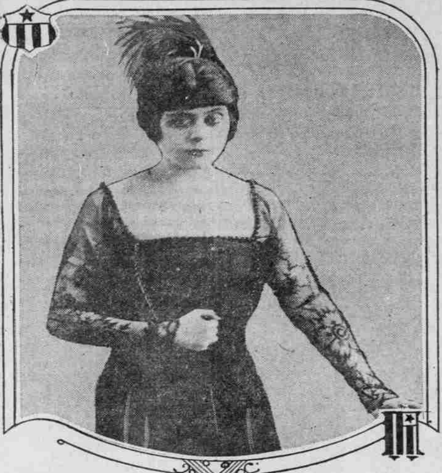
Theda Bara, Star of "Gold and the Woman," at Sunset Theater

TODAY'S FILM FEATURES. Peoples—Sarah Bernhardt, "Mothers of France"; Star—Robert Warwick, "The Heart of a Hero"; Double Cross—Thea Bara, "Gold and the Woman"; Columbia—Emily Stevens, "The Wheel of the Law"; Sunset—Theda Bara, "Gold and the Woman"; Globe—"The Love Thief," "Patia"; Circle—"Adventures of Shorty Hamilton."