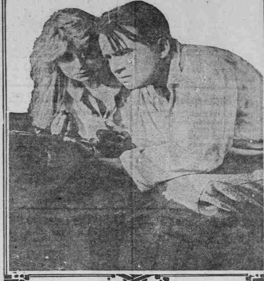
Douglas Fairbanks And Scene Over In The Lamb At Sunset Theater

TODAY'S FILM FEATURES. Sunset—Douglas Fairbanks, "The Lamb." Peoples—Ethel Clayton, "The Bondage of Fear." Star—Crane Wilbur, "The Painted Lie." Majestic—Alice Joyce and Harry Carey, "The Bondage of Fear." Columbia—Pauline Frederick, "Sapho." Globe—Max Marsh, "Her Condemned Sin." Circle—"Adventures of Shorty Hamilton."