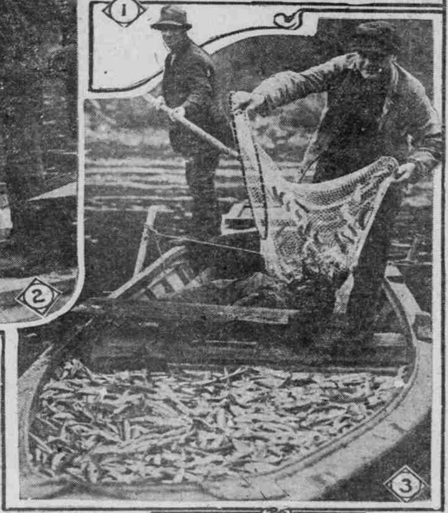
1—A Place Along the Bank Where the Smelt Are Being Scooped Up by the Tons Daily. 2—One Scoopful. 3—A Boatload Representing Some 1500 Pounds.

Following is an 80-year-old "trade recipe" from England: Clean the fish and bring to a boil in brine that will float an egg. Drain from the liquor and when cold, pack close in small wooden "kits" or kegs. Fill up with equal parts vinegar and brine, the fish was cooked in that has been strained and well skimmed. Let rest for a day, then fill up again with equal parts good vinegar and brine, and head up the kit as close as possible.