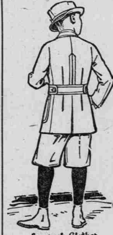
Sampeck Clothes The Standard of America