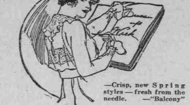
—Crisp, new Spring styles—fresh from the needle. —"Balcony"