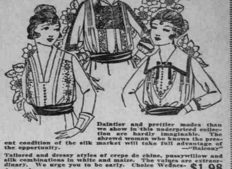
Daintier and prettier modes than we show in this underpriced collection are hardly imaginable. The shrewd woman who knows the present market will take full advantage of the opportunity.

Tailored and dressy styles of crepe de chine, passy-willow and silk combinations in white and maize. The values are extraordinary. We urge you to be early. Choice Wednes-day only.