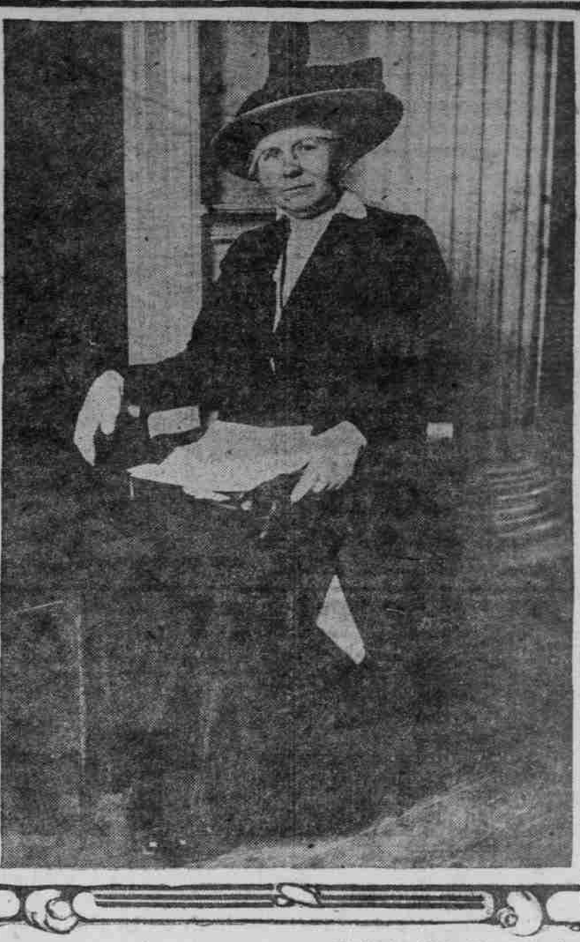
MISS IDA M. TARBELL.