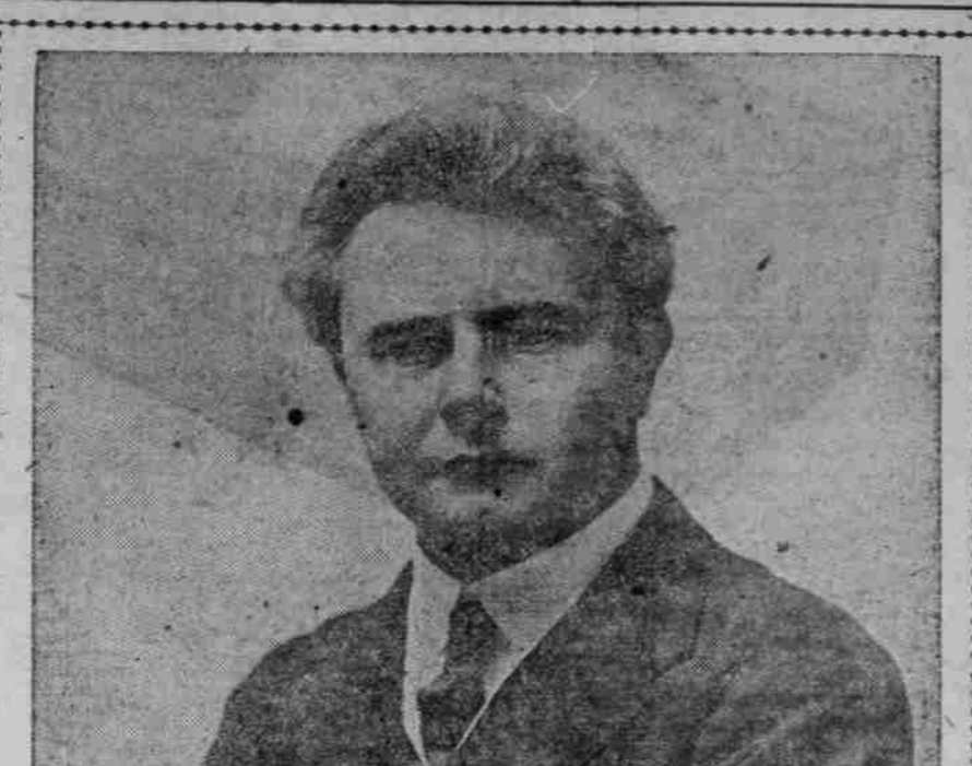
JOSEF HOFMANN, PIANIST, WHO PLAYS AT HELIG THEATRE TOMORROW NIGHT.

New York Critic Declares Noted Pianist Has Earned Crown as He Has Gone Further Than Any of His Contemporaries.