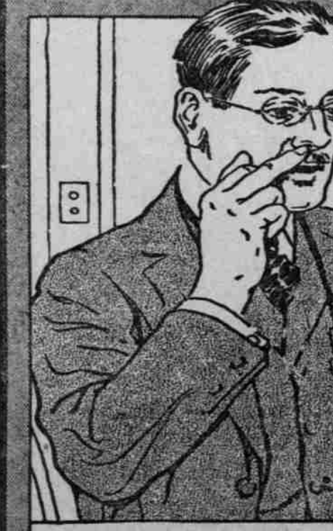
"Kondon's" Helps Him Start the Day.

HYGIENE CORSET CO. 81 W. 12TH ST. CINCINNATI