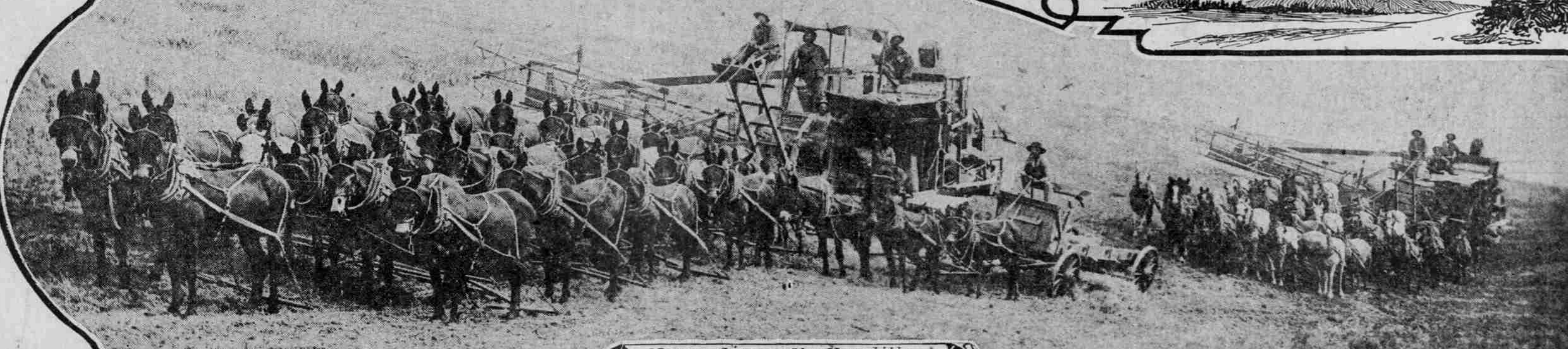
Harvesting on the Umatilla Indian Reservation. - Moorhouse.