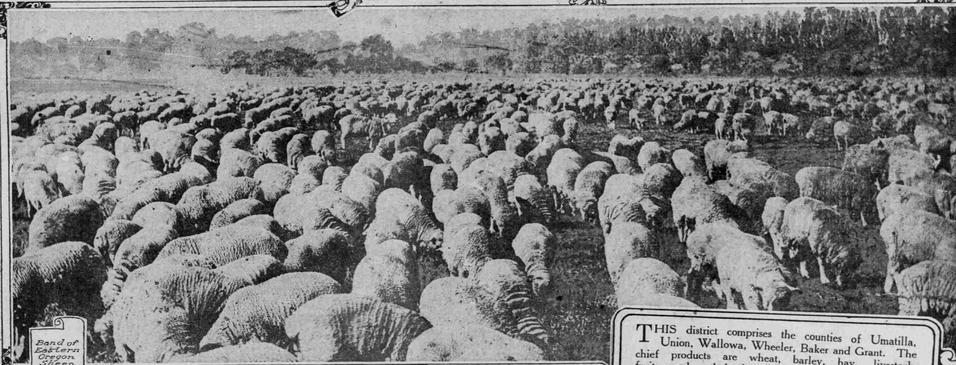
Band of Eastern Oregon Sheep.

T HIS district comprises the counties of Umatilla, Union, Wallowa, Wheeler, Baker and Grant. The chief products are wheat, barley, hay, livestock, fruit, wool and lumber (yellow pine). In addition, the mineral production of Baker and Grant counties amounts to several millions of dollars annually.