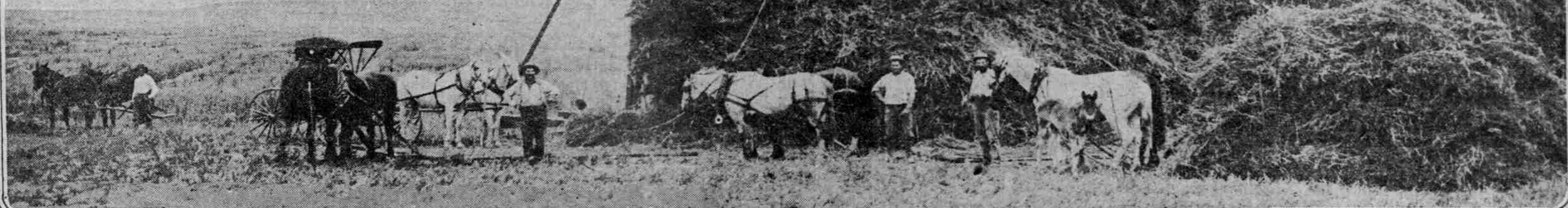
Alfalfa Harvesting on Irrigated Land.