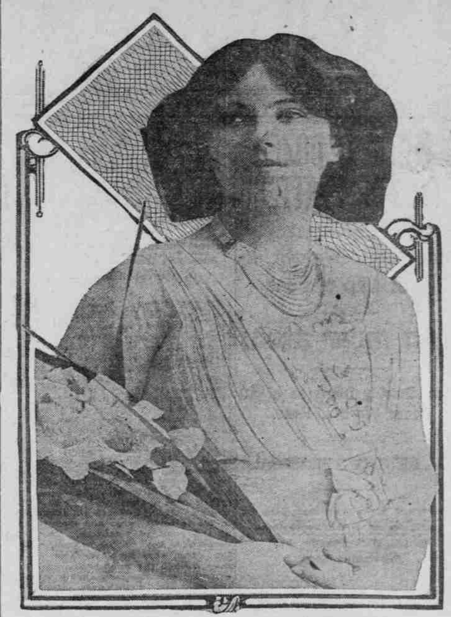
COUNTESS TORBY, BRIDE OF PRINCE GEORGE OF BATTENBERG.

RELATIVE OF RUSSIAN CZAR WHO WEDS ROYAL BRITON.