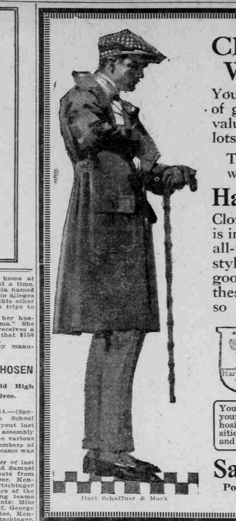
Hart Schaffner & Marx