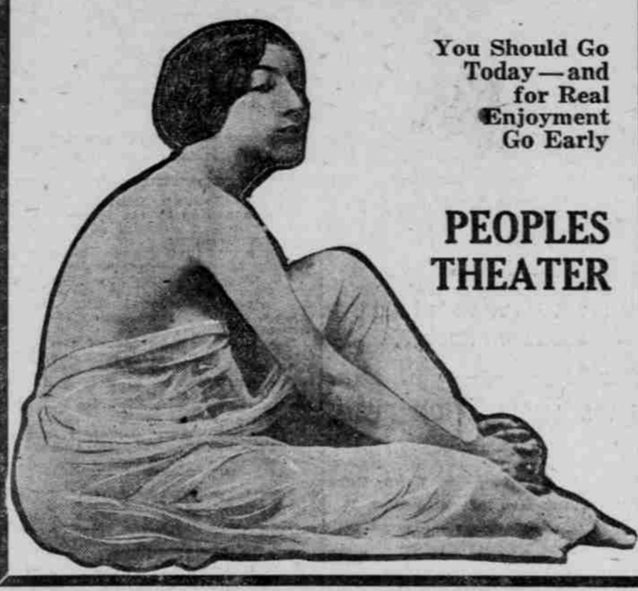
Governor's daughter by a second marriage.

After the marriage Mary goes to Madison and tells him the story. Then she learns that Marion is her own daughter. The plot has acted as a boomerang and her only child has become the bride of an ex-convict. Then the situation is cleared when events prove that Walters had been innocent of the crime for which he was punished, and had gone to the penitentiary for a friend.