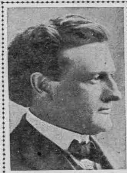
ical Leader, Who Is Attending Pythian Convention, and Who Will Speak at Republican Mass Meeting Friday Night.