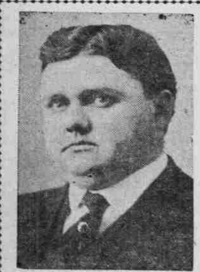
President of Association of District Attorneys of Oregon.

One feature of the present statute which was mentioned particularly was the provision for the purchase of alcohol for external purposes. It was pointed out that the constitutional amendment does not authorize the purchase of alcohol for such purposes. A section of the statute which it was suggested should be made more specific is the one limiting the importation of liquor to one family. The question which the District Attorneys are particularly interested in and which