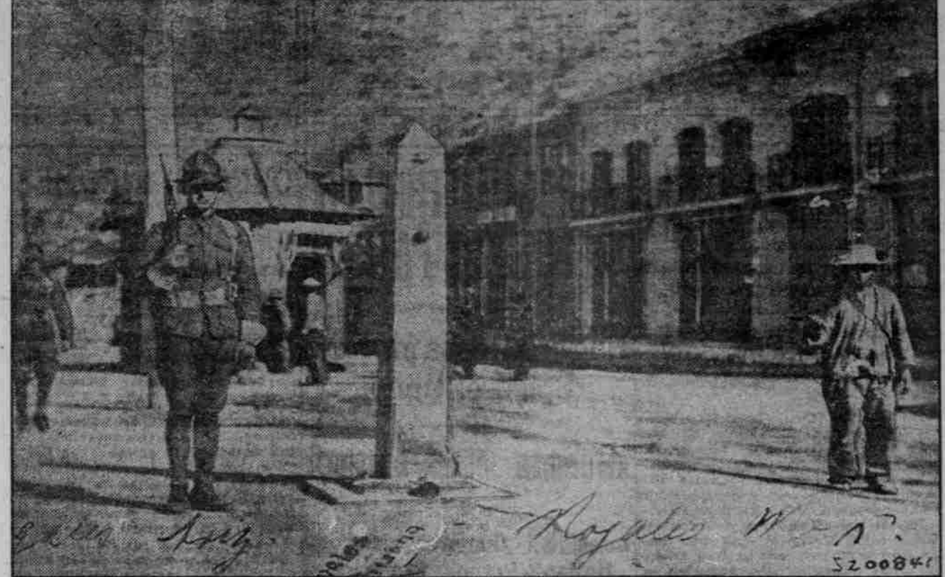
With the relations between the United States and Mexico about to snap at any moment, the border patrol is particularly vigilant. This photograph, taken at Nogales, Ariz, on the line, shows on one side the American trooper patrolling and on the other side the Mexican soldier doing sentry duty. The photo gives a comparison between the snappy American trooper and the sloppy, unkempt Mexican soldier. The white slab in the middle of the road indicates the boundary line between the United States and Mexico.

For instance, the greatest victory of Works in Verdun Region Succumb to Violent Assault