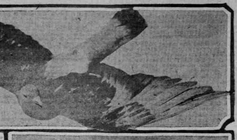
Photo Above—Bird in Full Flight. Below—Ready for the Start, With Message Tied in Neat Roll to One Leg.

A skyrocket, shot off as part of last night's anniversary celebration, lit on the roof of the house at 323 Park street, corner of Clay, and set fire to the building.