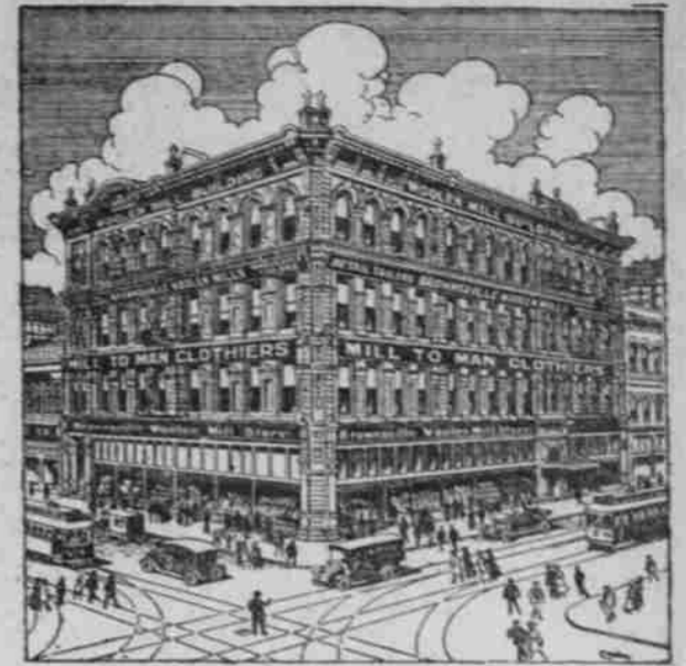
WOOLEN MILL BUILDING, Home of Brownsville Clothing for Men and Boys.