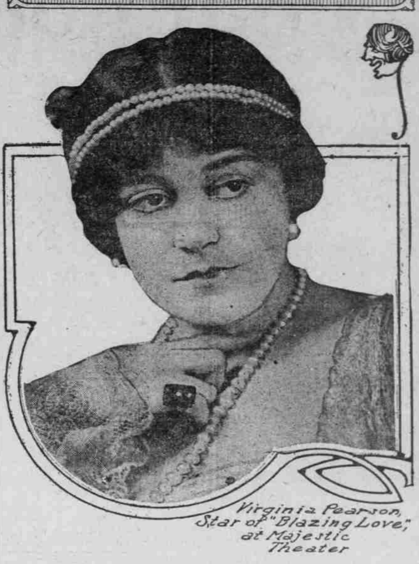
Virginia Pearson, Star of "Blazing Love," at Majestic Theater

TODAY'S FILM FEATURES. Pickford—"The Social Highwayman." Hellig—"The Birth of a Nation." Columbia—"Sunshine Dad," "The Other Man." Peoples—"The Heart of Nora Flynn." Majestic—"Blazing Love." Sunset—"The Battle Cry of Peace."