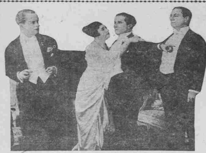
DRAMATIC SCENE FROM "SCANDAL," THE FOX FEATURE STARRING BERTHA KALICH AT THE MAJESTIC THEATRE.

TODAY'S FILM FEATURES. Columbia—"The Habit of Happiness," "Gypsy Joe." Majestic—"Slender," "The Heart of Paula," "The Goddess." Pickford—"Then I'll Come Back to You." Sunset—"A Modern Sphinx." Circle—"The Coward."