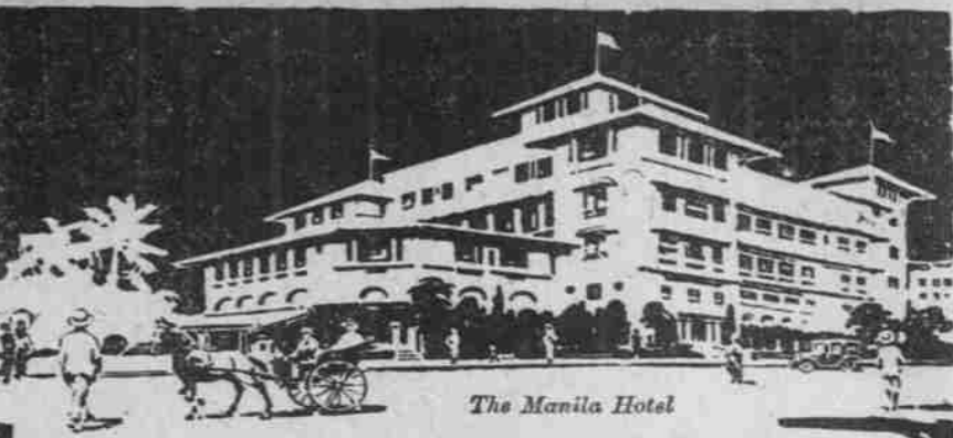
The Manila Hotel