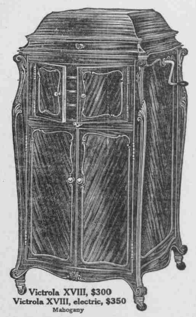
Victrola XVIII, $300 Victrola XVIII, electric, $350 Mahogany

Any Victor dealer will gladly give you a descriptive list of these new Victor Records and play any music you wish to hear. There are Victors and Victrolas in great variety of styles from $10 to $400. Victor Talking Machine Co., Camden, N. J.