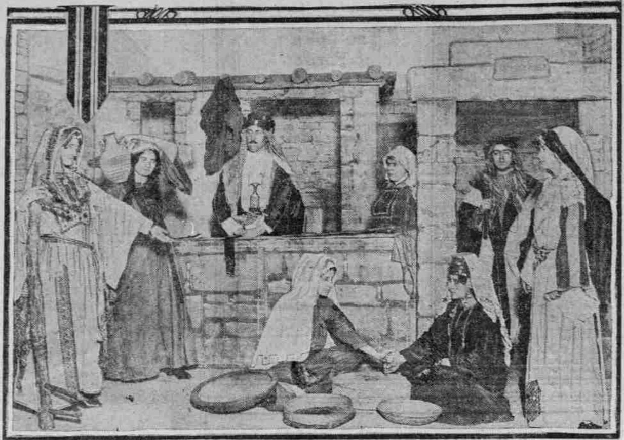
SCENE DEPICTED—A BETHANY HOME.