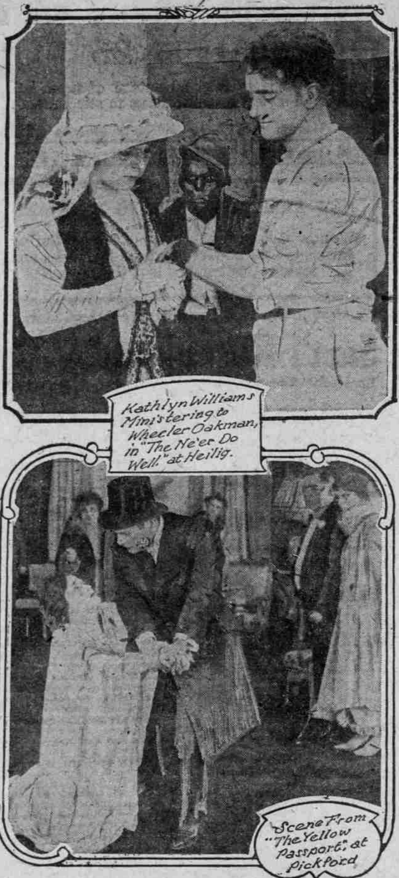
Kathlyn Williams Ministering to Wheeler Oakman, in "The Ne'er-Do-Well," at Heilig.