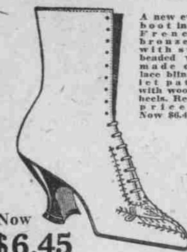
A new evening boot in dull French or bronze kid, with steel- headed vamps, made on the lace blind eye- let pattern with wood LVX heels. Regular price $7.50. Now $6.45.