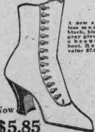
A new seam- less model in black, blue and gray give kid, a beautiful boot. Regular value $7.00.