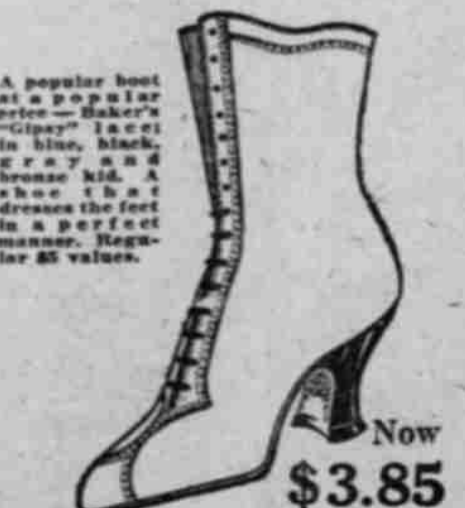
A popular boot at a popular price—Baker's "Gipsy" lace in blue, black, gray and green kid. A shoe that dresses the feet in a perfect manner. Regu- lar $5 values.