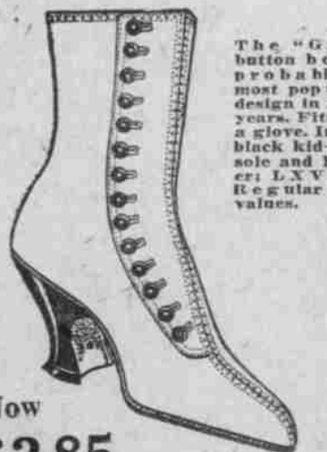
The "Gipsy button boot"— probably the most popular design in many years. Fits like a glove. In soft black kid—welt sole and leather. LVX heel. Regular $4.00 values.