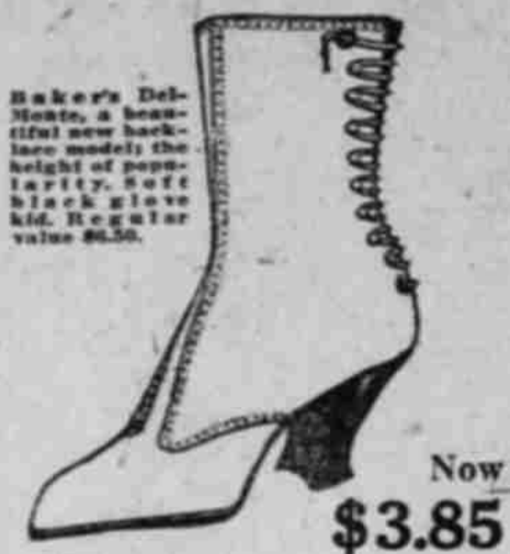
Baker's Del- Monde, a beau- tiful new back- lace model; the height of popu- larity. Soft black or blue kid. Regular value $6.50.