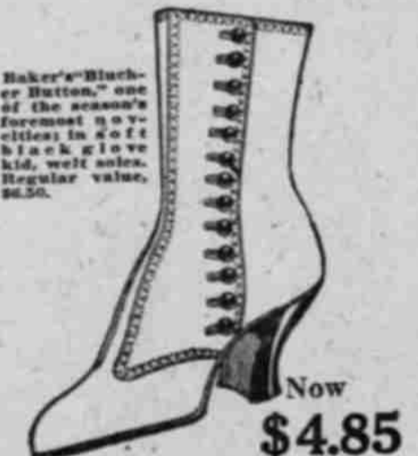
Baker's "Blush- er Button," one of the season's foremost "re- vivals" in soft black give kid, welt soles. Regular value, $6.50.