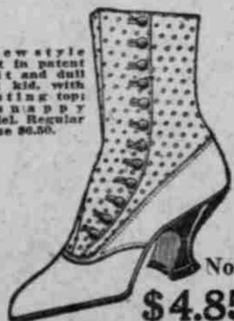
A new style boot in patent colt and dull mat kid, with vesting top; a sharp model. Regular value $6.50.