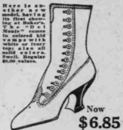
Here is an- other new model, having its first show- ing at Baker's. The "Del Monde" comes in colored kid vamps with white or ivory top; also all solid colors. Soft. Regular $5.00 values.