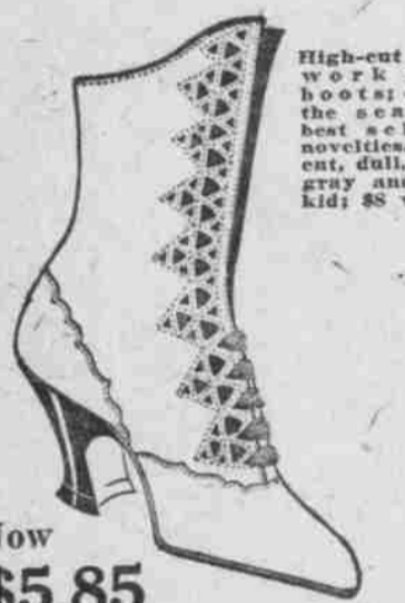
High-cut open- work lace boots; one of the season's best selling novelties. Pat- ent, dull, pearl gray and blue kid; $8 values.