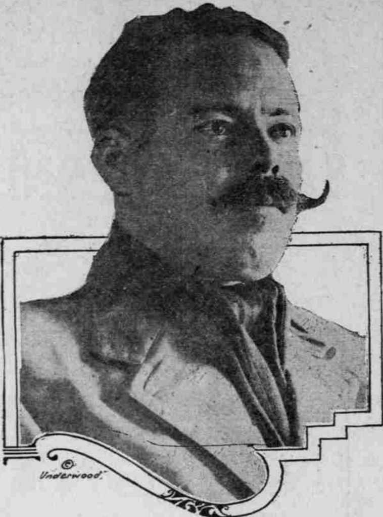
FRANCISCO (PANTO) VILLA.