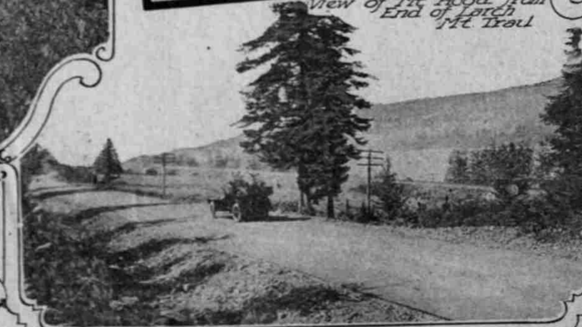
Section of Highway Along the Lower Level.