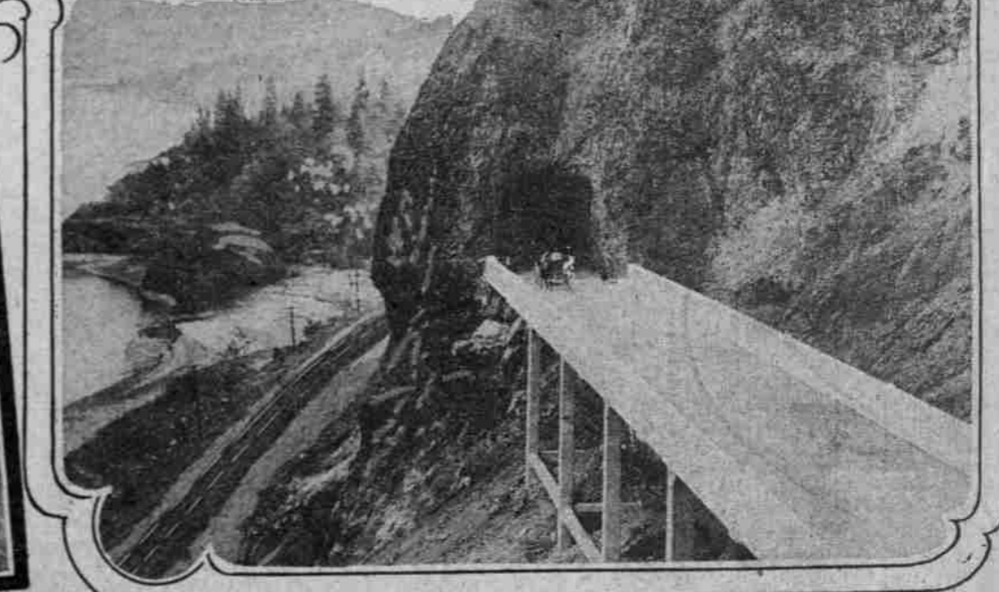
West Approach to Tunnel at Mitchell's Point