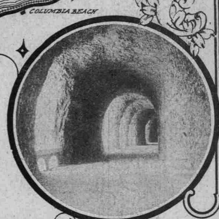
Interior View of Tunnel at Mitchell's Point