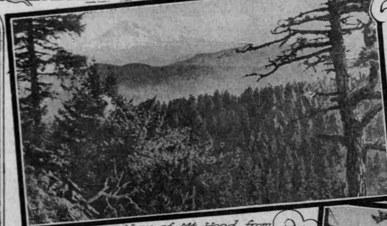
View of Mt Hood from End of Larch Mt. Trail